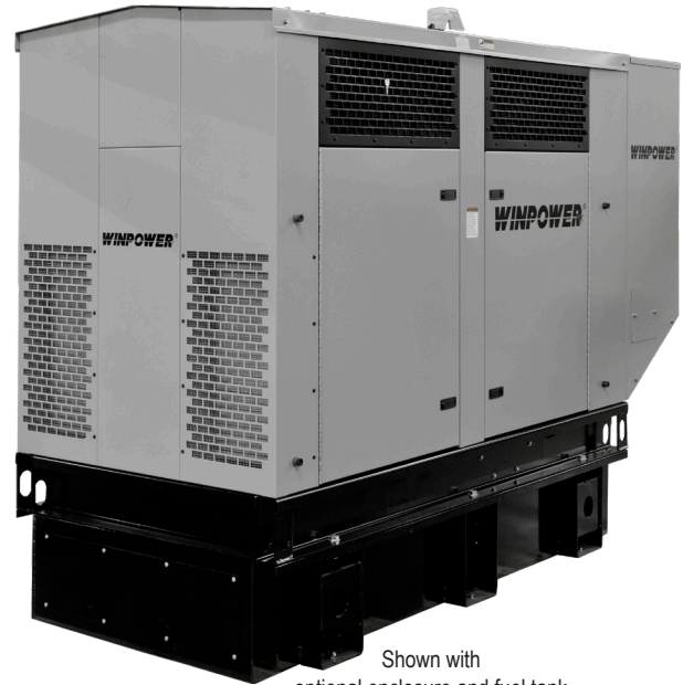
Shown with optional enclosure and fuel tank

We load test every generator before it leaves our facility.